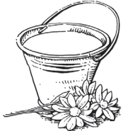
• PLAIN •

2064 Highway 116 North Bldg. 1, Suite 130 Sebastopol, California 95472 ph (707) 823-8250 greenvalleylactosefree.com