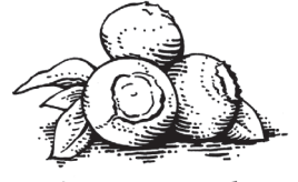
• BLUEBERRY •