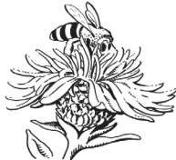
• HONEY •