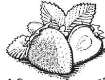
• STRAWBERRY •